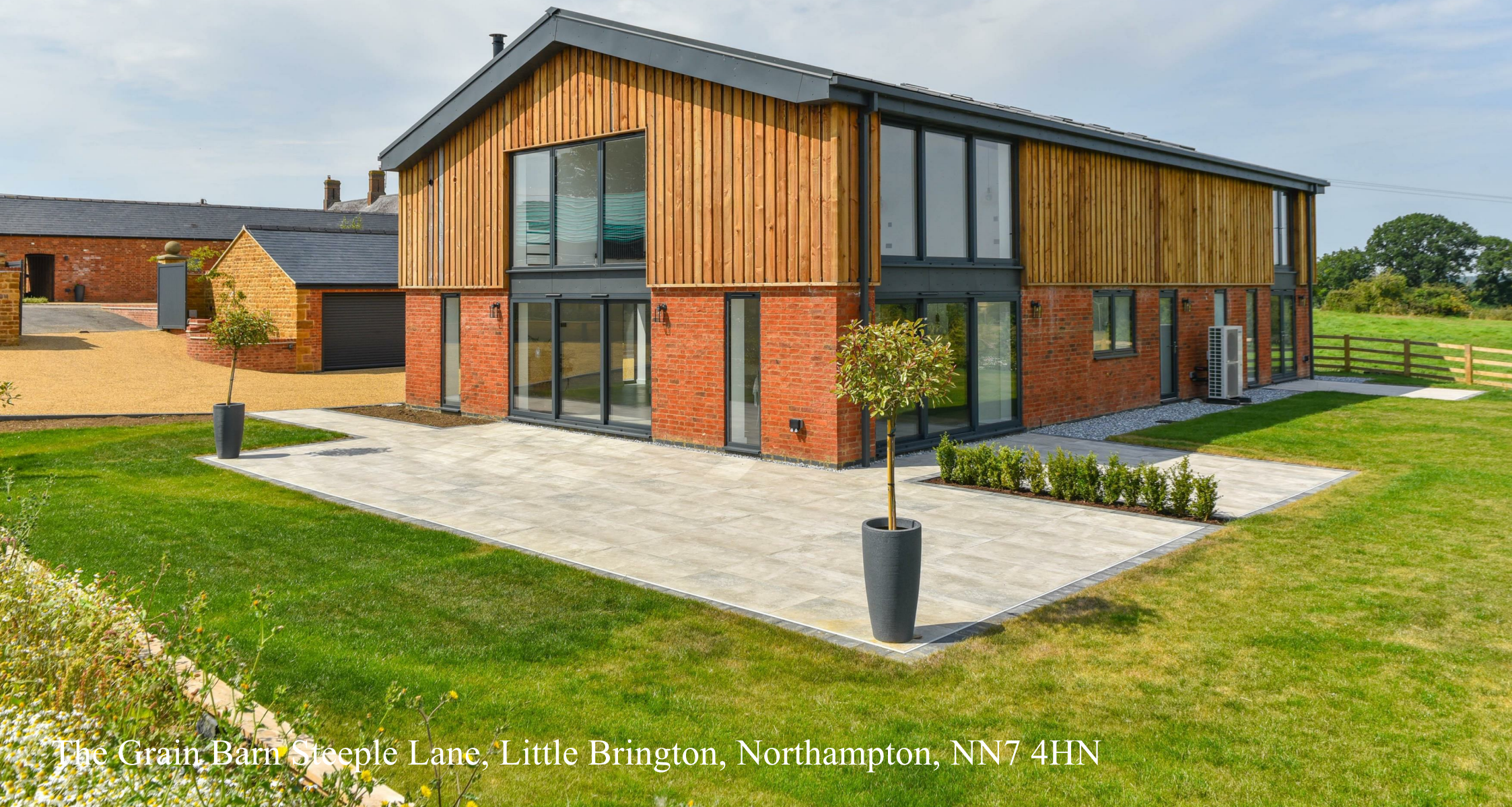
The Grain Barn Steeple Lane, Little Brington, Northampton, NN7 4HN